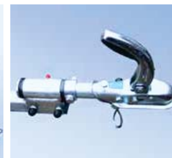
Swivel Hitch option available for off road use only (Not type approved for road use*)