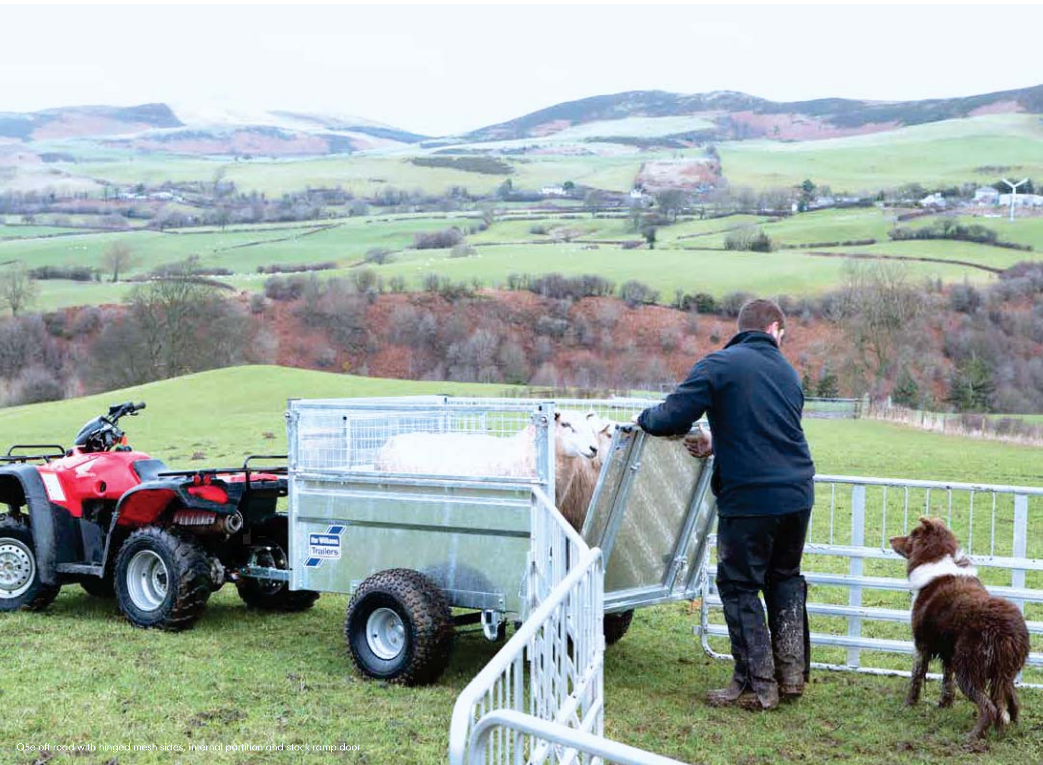
Q5e off-road with hinged mesh sides, internal partition and stock ramp door