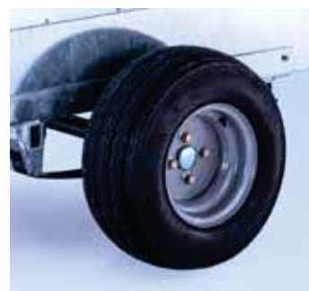
Q5/6/7e off-road flotation tyres (20.5 x 8-10)