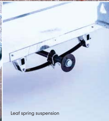
Leaf spring suspension