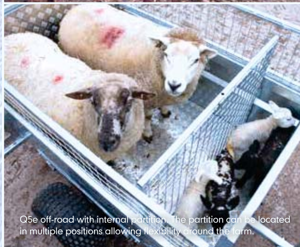
Q5e off-road with internal partition. The partition can be located in multiple positions allowing flexibility around the farm.