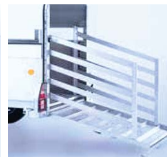
Optional ramp gates available on Q6, 7 and 8