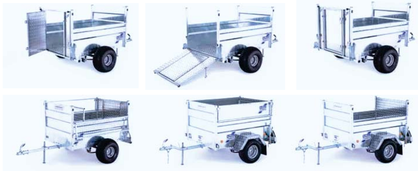
Q5 Q5e off-road and road versions showing different ramp, hinged sides and internal partition options