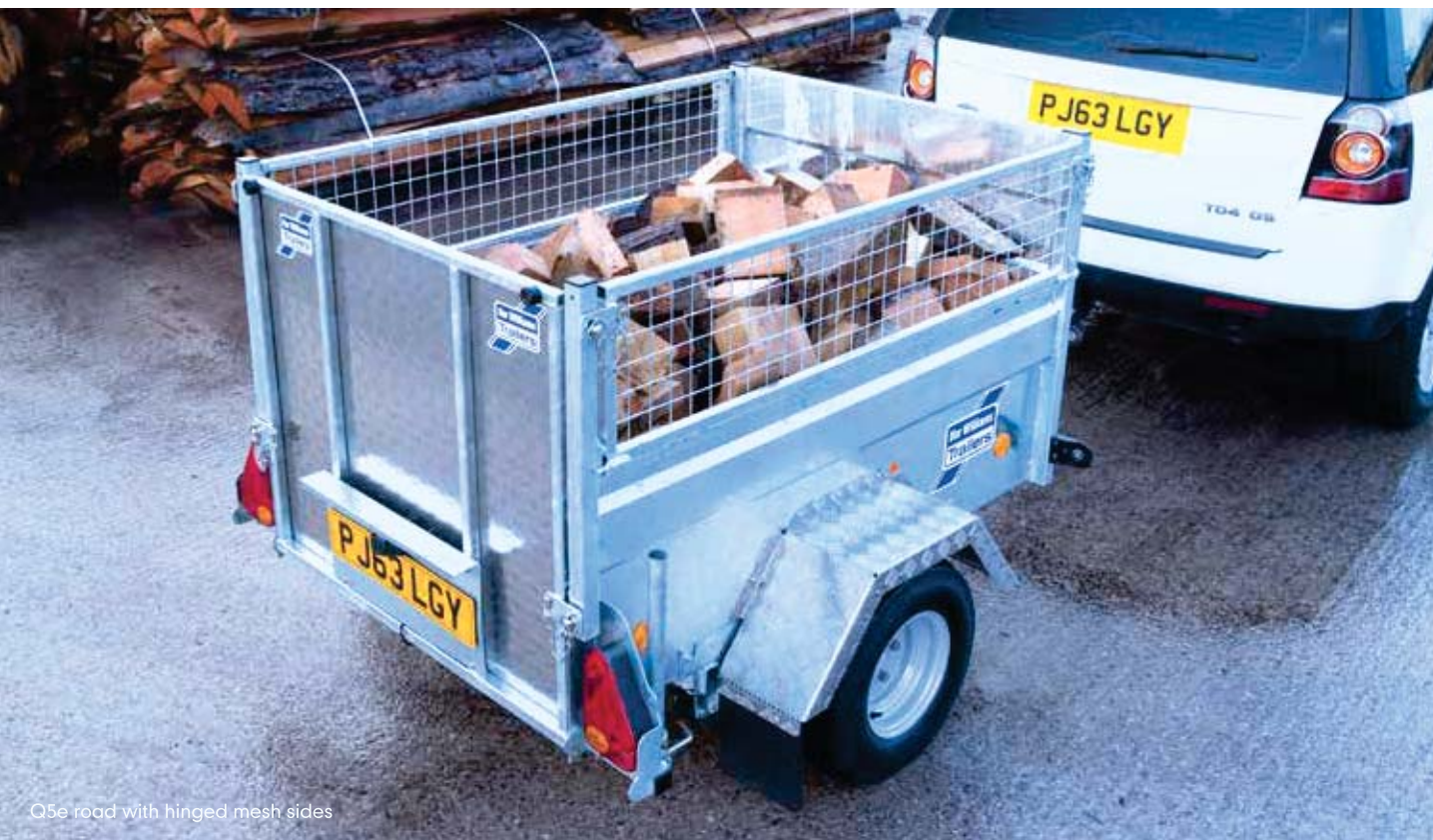
Q5e road with hinged mesh sides