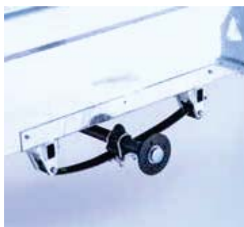
Leaf spring suspension is standard