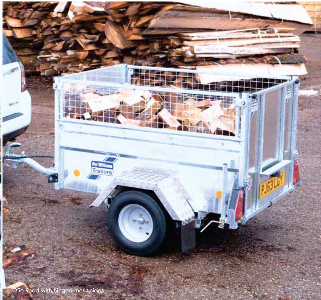
Q5e Road with hinged mesh sides

*Please check towing vehicle manufacturer's handbook for maximum unbraked towing limit.