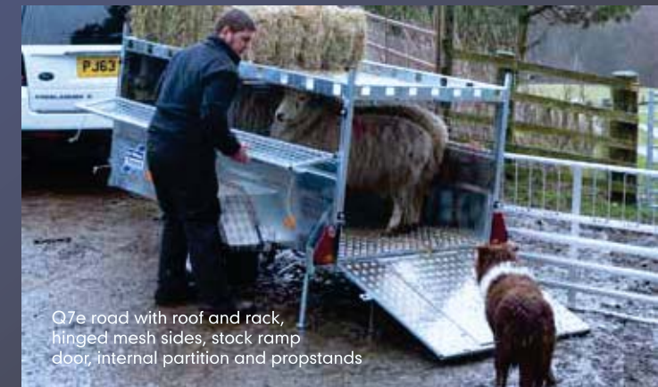
Q7e road with roof and rack, hinged mesh sides, stock ramp door, internal partition and propstands

* The roof and rack has a maximum recommended weight of 50kg and uses two fasteners which are easily removed.