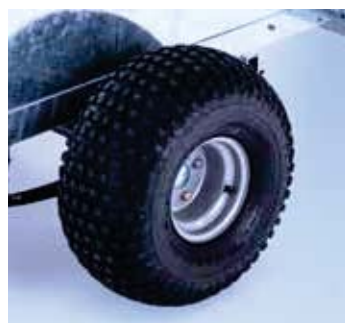
Q5e off-road knobby tyres (22 x 11-8)