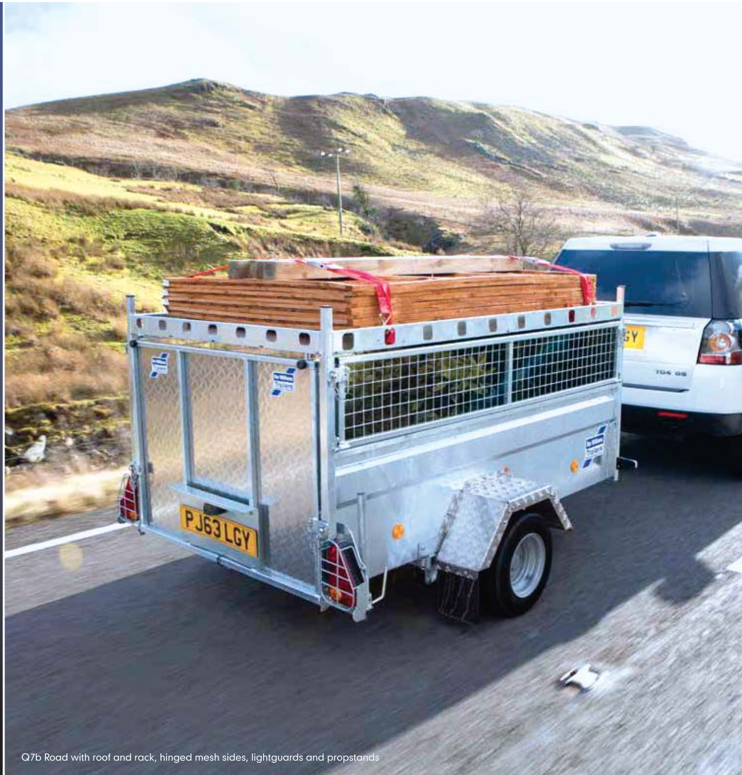
Q7b Road with roof and rack, hinged mesh sides, lightguards and propstands

We are an independent company with one focus: to build the best products on the market. More than 30,000 people choose our trailers each year – but we are not standing still. Our dedicated investment in new technologies and materials ensures that our products continue to exceed the expectations of our customers. We know that quality, strength, value and ease of maintenance are of vital importance to you. That is why we have made them the driving force behind everything we do.